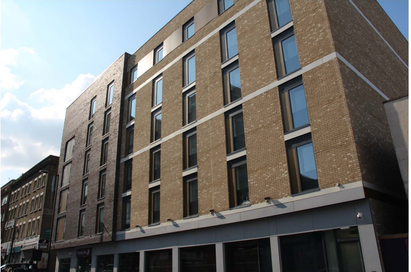
25-27 Dalston Lane