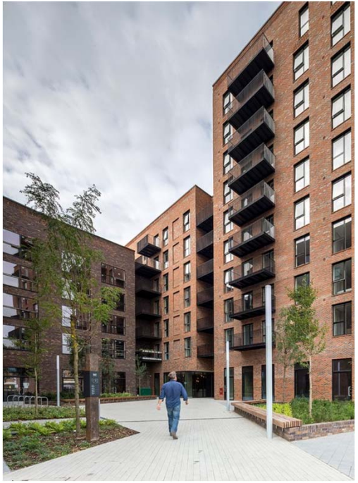
113 The Timberyard, Drysdale Street, London, N1 6ND www.CMA-Planning.co.uk