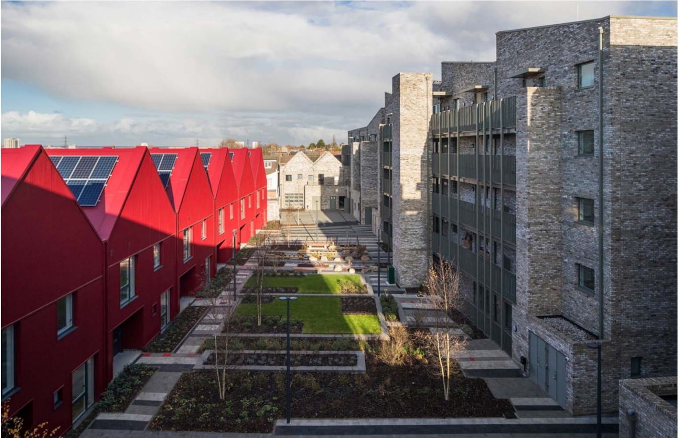
Architect: Levitt Bernstein